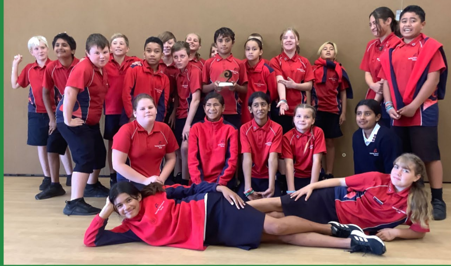
tēnā koutou Hastings Intermediate Room 10

This year we have introduced the 'Kiwi Can Class of the Week' trophy. Each class that has so far won the trophy have been super excited (after all, everyone loves a trophy). In week 8, Hastings Intermediate Room 10 took out the trophy with their awesome Kiwi Can values, respect, and the input they all contributed to the programme.