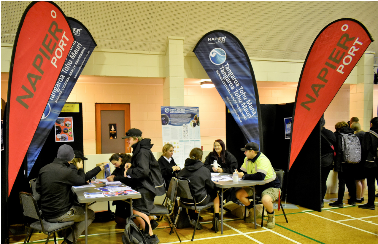
Napier Port team engage with rangatahi at the Flaxmere College Pathway Experience

Keen to know more? Read more about the amazing outcomes from the event